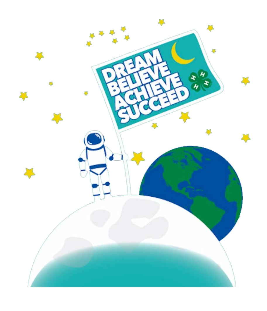
NC 4-H Congress