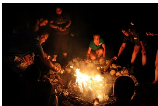
Honor Club Conference participants gather around the bonfire.