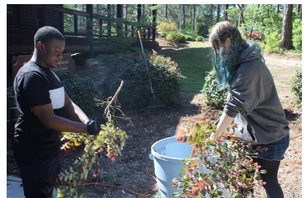
Honor Club Conference participants engage in Community Service.